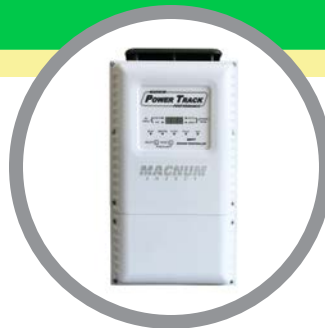
Up to seven (7) PT-100 Charge Controllers for 42kW output at 48V