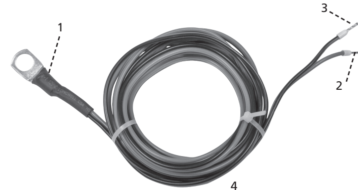
Fig.1 Components of Battery Temperature Sensor