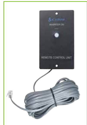
CPI A20 Optional remote on/off switch

To determine the required wattage for a device. Look up the required Amps a device is rated. This Amperage is found on the device's I.D tag found on the back of the device. Multiply the Amps x Volts = Watts.