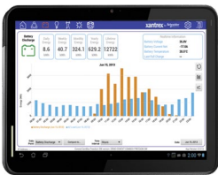
Conext ComBox Android mobile application