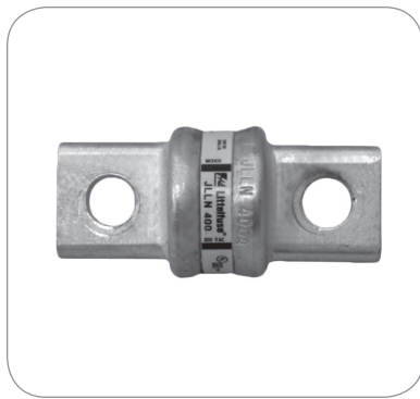
Fig. 2. Class "T" 400 Amp Fuse Replacement JLLN 400 Amp fuses are also sold separately. Samlex Model: JLLN-400