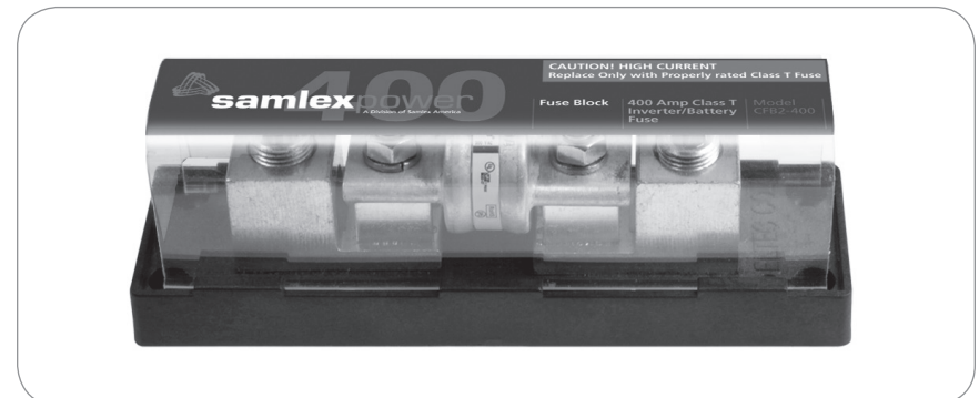
Fig. 1. Class "T" Fuse Assembly