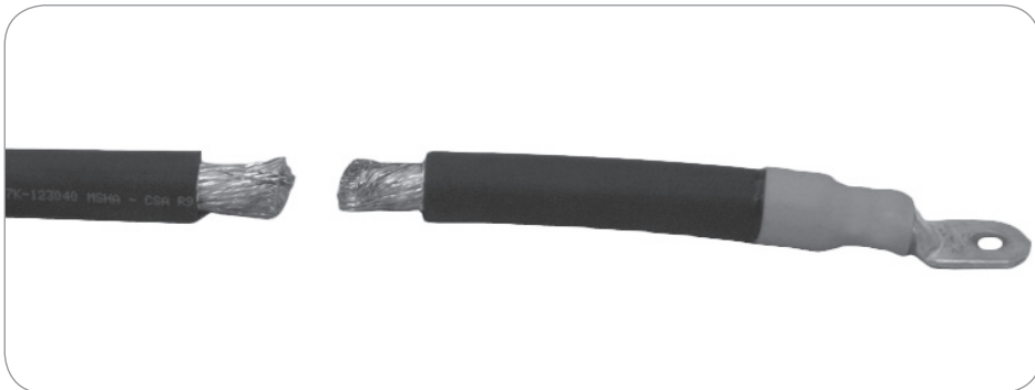
Fig. 4. Battery end of Positive cable cut and prepared for inserting into the Class "T" Fuse Block

A. The fuse should be installed within 7 inches of the Positive Terminal of the battery. Cut the Positive cable based on the desired location of the Class "T" Fuse Block using wire cutter. Strip 1.05" of the insulation at the cut ends using a stripper. Please ensure that the innermost layer of the tape separator is completely removed. See Fig. 4.